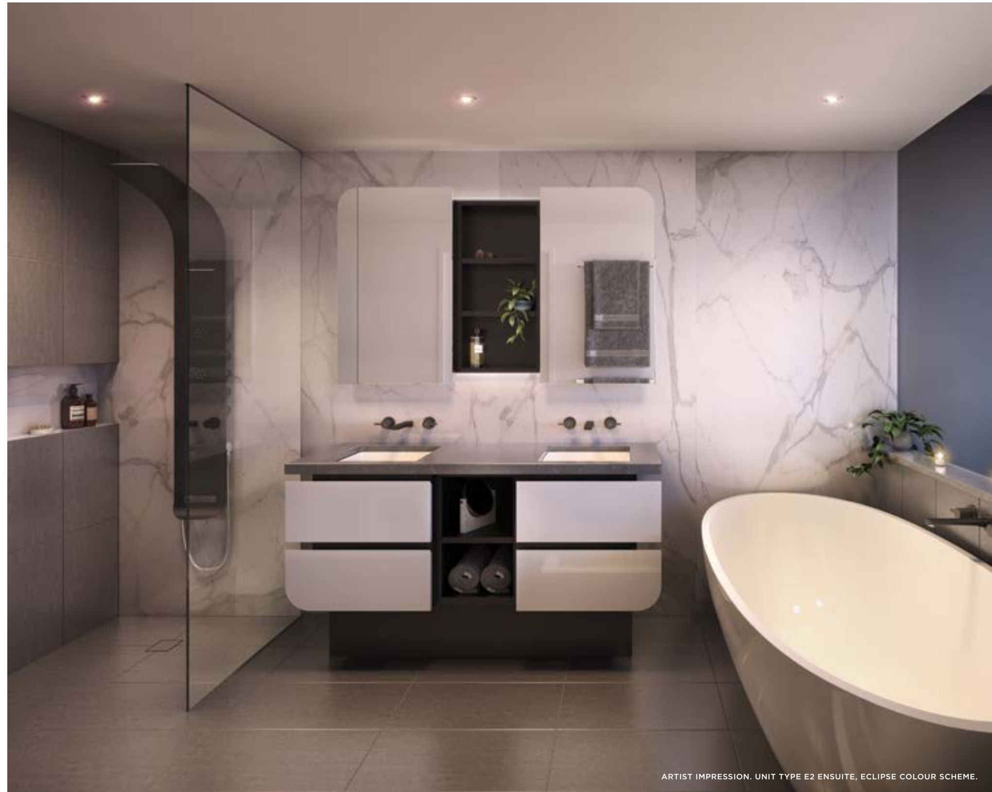
ARTIST IMPRESSION. UNIT TYPE E2 ENSUITE, ECLIPSE COLOUR SCHEME.

Superbly appointed entertainer kitchens shape the centre of daily life and a natural venue for family and guests to gather for occasions big and small. Stunning 40mm reconstituted stone bench tops and expansive 2.4 metre islands make for functional yet beautiful and sophisticated family spaces. Exquisite splash backs with feature large format tiles reflect Halo's promise of enduring quality and style while thoughtful luxury essentials such as soft-closing drawers and spacious pullout pantries make everything simply effortless. A superior suite of premium European appliances are easily integrated into the designs to create a perfectly tailored look and feel.