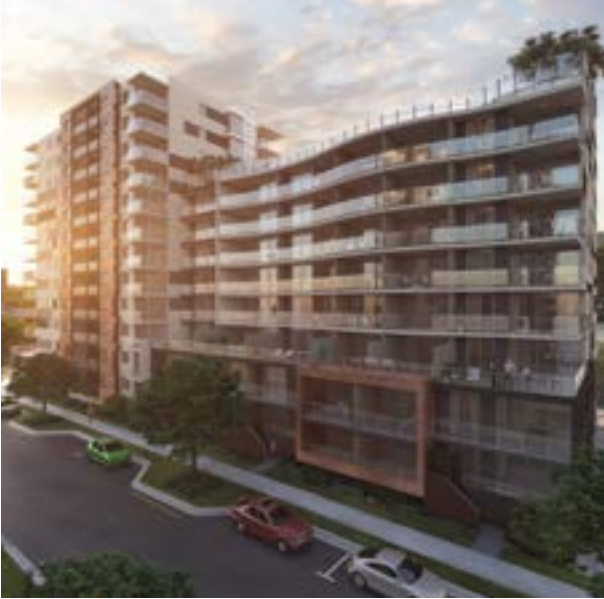
BREEZE, WEST END