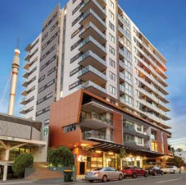
ALTO - SKYNEEDLE, SOUTH BRISBANE