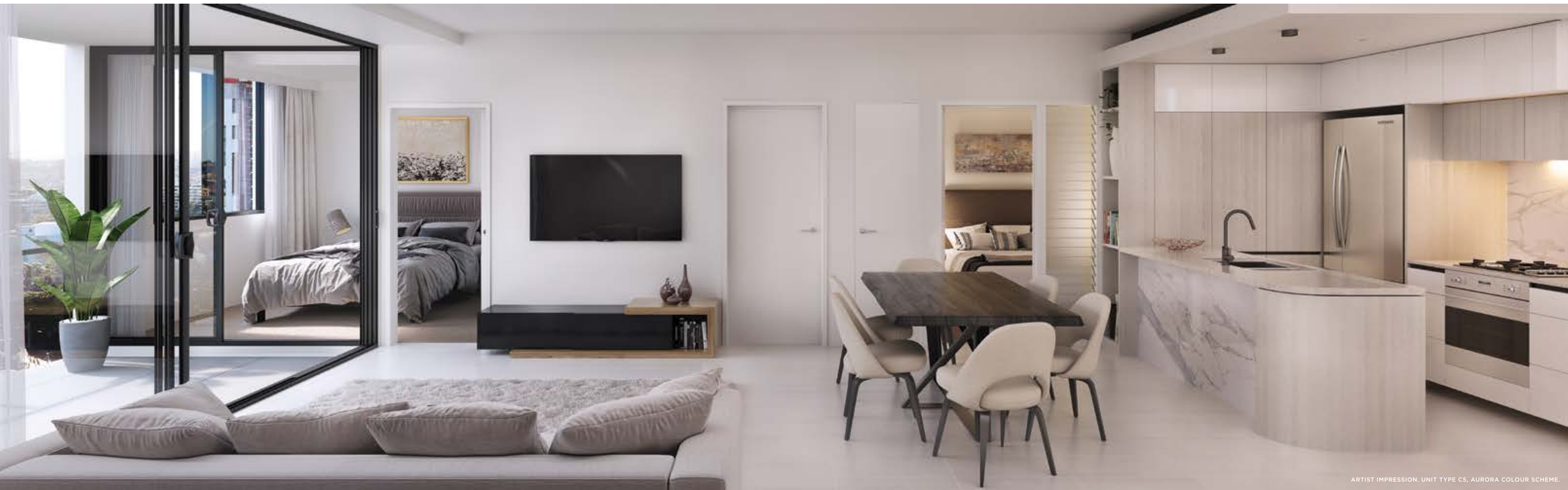
ARTIST IMPRESSION. UNIT TYPE C5, AURORA COLOUR SCHEME.