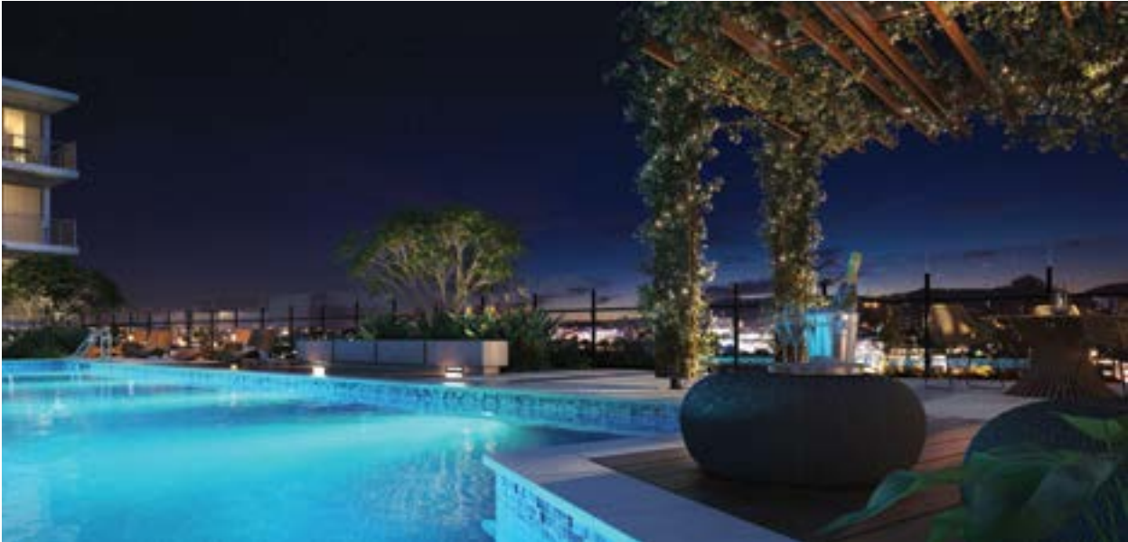
BREEZE, WEST END

bureau^proberts has over 20 years’ experience designing award-winning projects including multi-residential and mixed use developments in Australian and international markets. Their strong commercial awareness and focus on design delivers a high sales rate and value for their clients.