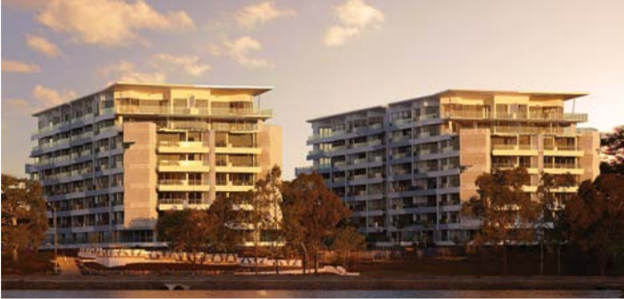
WATERS EDGE, WEST END