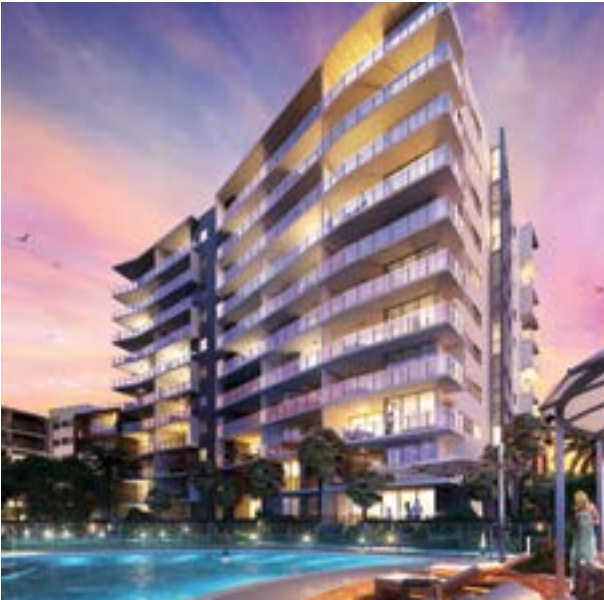
RADIANCE - LIGHT+CO, WEST END