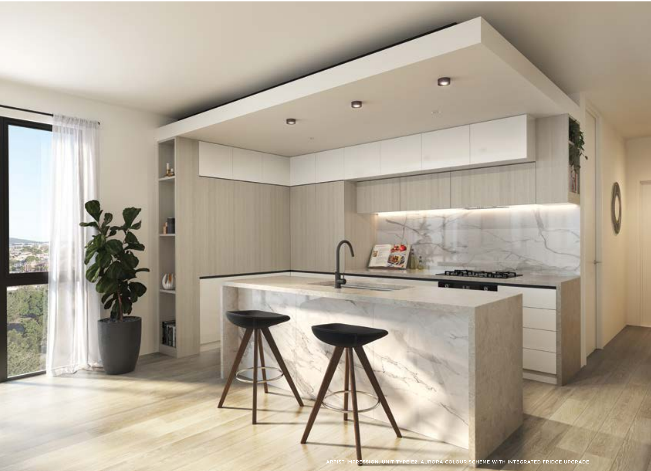
ARTIST IMPRESSION. UNIT TYPE E2, AURORA COLOUR SCHEME WITH INTEGRATED FRIDGE UPGRADE.