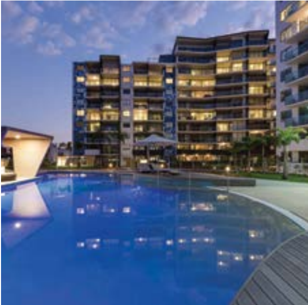
PARC - GARDENS, WEST END