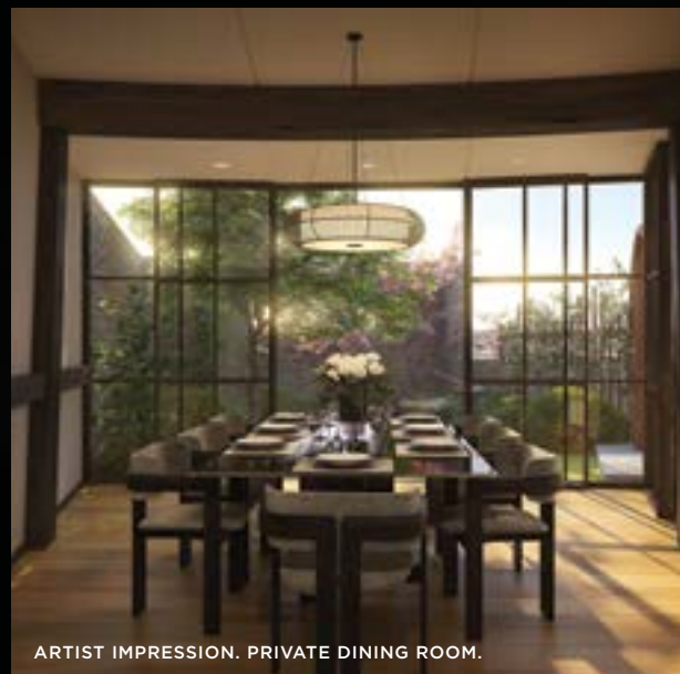
ARTIST IMPRESSION. PRIVATE DINING ROOM.