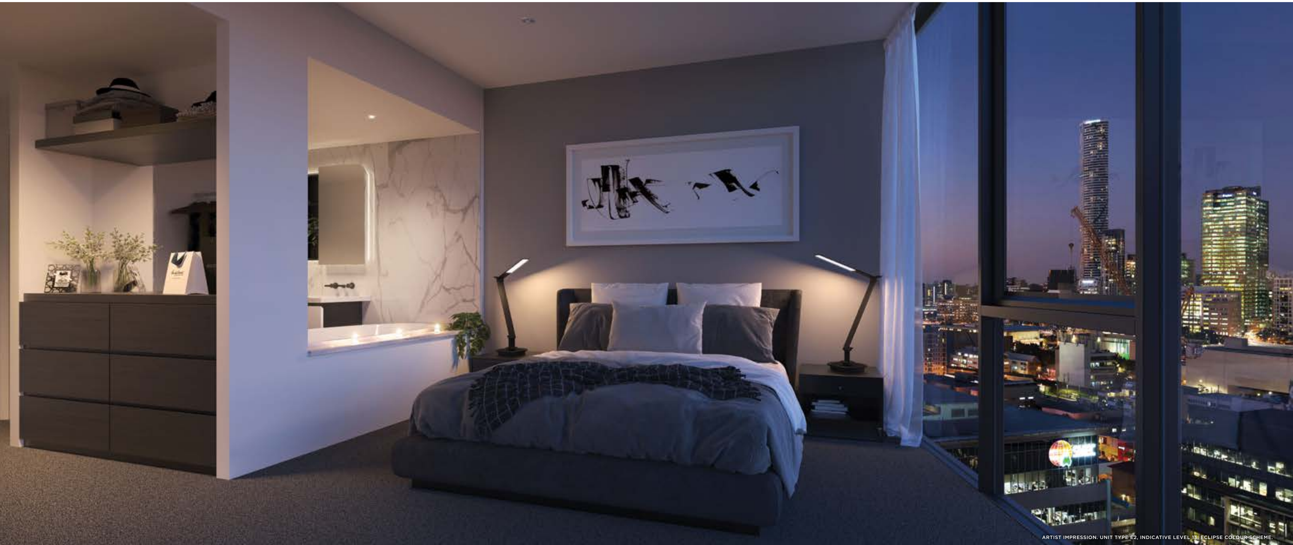
ARTIST IMPRESSION. UNIT TYPE E2, INDICATIVE LEVEL 13, ECLIPSE COLOUR SCHEME.