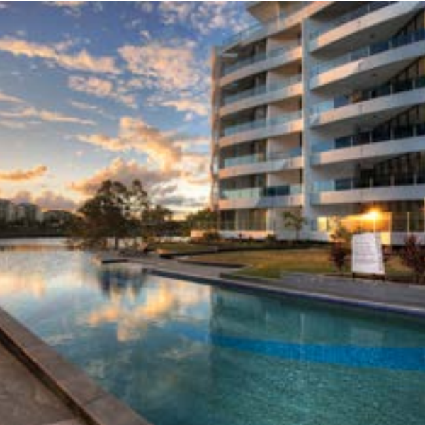
DRIFT - WATERS EDGE, WEST END