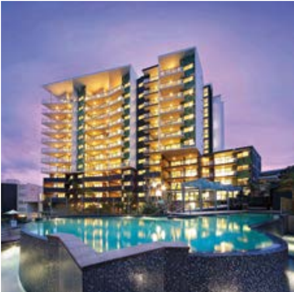
HORIZONS - URBAN EDGE, KELVIN GROVE