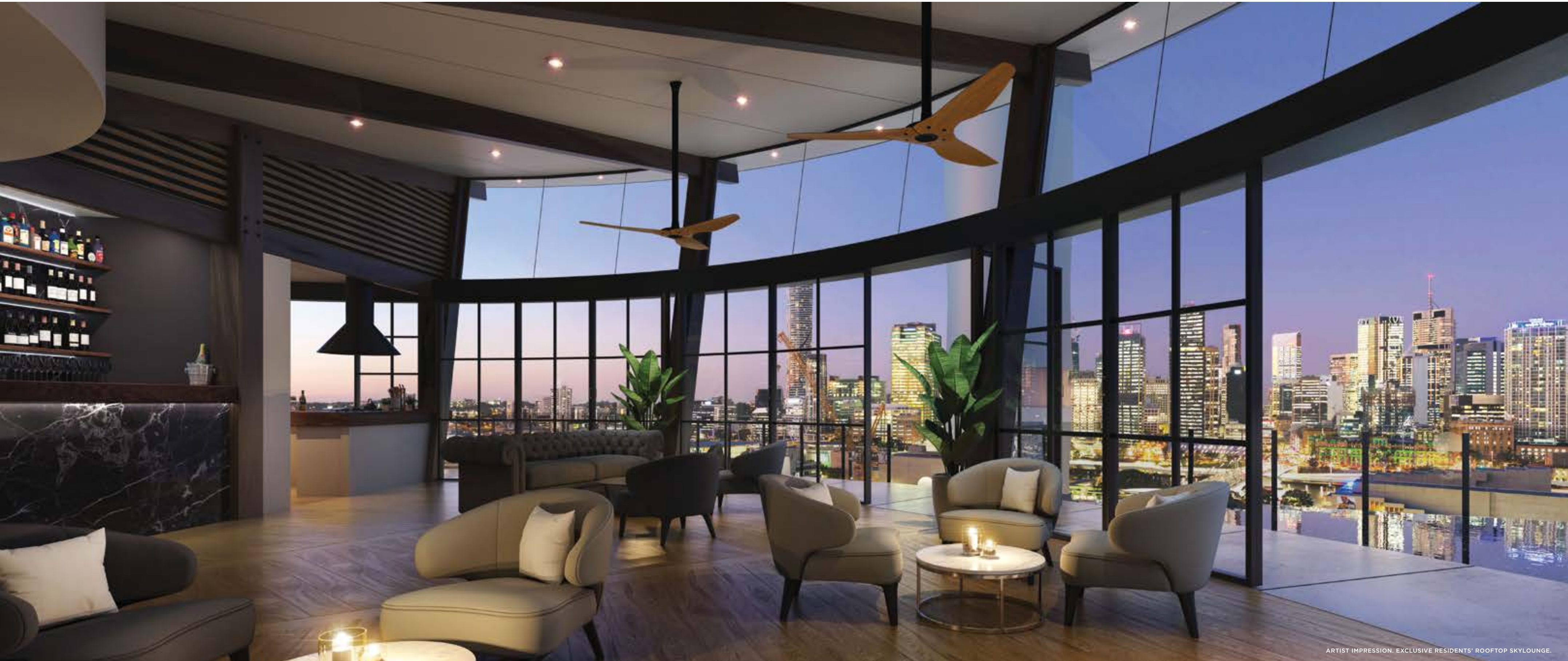
ARTIST IMPRESSION. EXCLUSIVE RESIDENTS' ROOFTOP SKYLounge.

The Halo Skylounge is the centrepiece of style, a sophisticated retreat admiring striking city views accompanied by a glass of your favourite wine. Enjoy an easy afternoon or evening with friends, or a romantic dinner with your loved one. Escape into a world of exclusivity even if it's just for a moment.