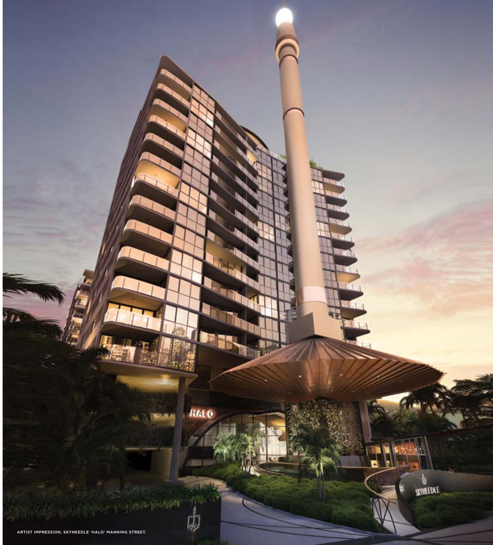
ARTIST IMPRESSION. SKYNEEDLE 'HALO' MANNING STREET.