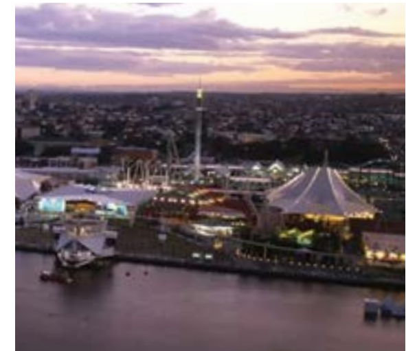
SOUTH BANK WORLD EXPO '88

Its precedent-setting fusion of architecture, lush tropical landscapes, and extraordinary on-site lifestyle will create a truly one-of-a-kind address, inspired by the world's finest resorts and grandest apartment buildings.