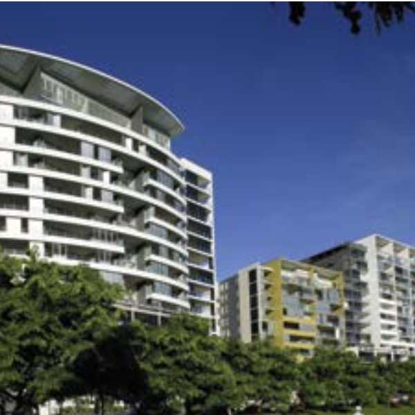
PARKLANDS, ROMA ST, BRISBANE